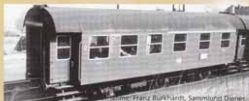
37601 Umbauwg. AB3yg 1./2. Kl. DB Ep. IV Rebuilt Passenger Car AB3yg 1./2.cl. DB IV