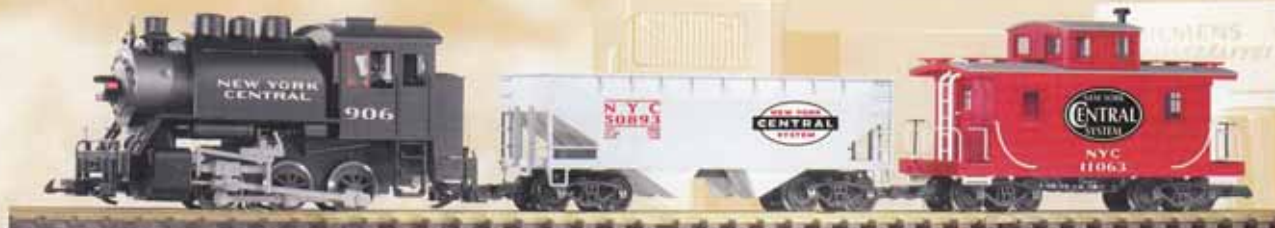
37102 New York Central Güterzug / New York Central Freight Train

Products bearing Union Pacific and Southern Pacific marks are produced under a trademark license from Union Pacific Railroad Company.