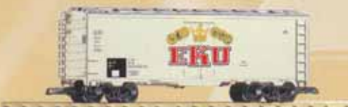
37803 Bierwagen „EKU“ DB Ep. III Refrigerator Car "EKU" DB III