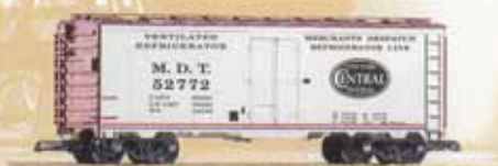
38810 New York Central Kühlwagen New York Central Steel Reefer