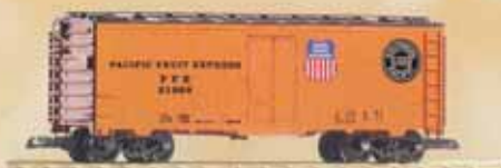
38805 Union Pacific Kühlwagen Union Pacific Steel Reefer