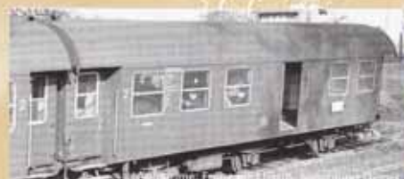
37602 Umbauwg. BD3yg 2. Kl. mit Gepäckabteil DB Ep. IV Rebuilt Passenger Car BD3yg 2. cl. w Luggage Compartment DB IV