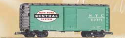
38806 New York Central Kühlwagen New York Central Steel Box Car