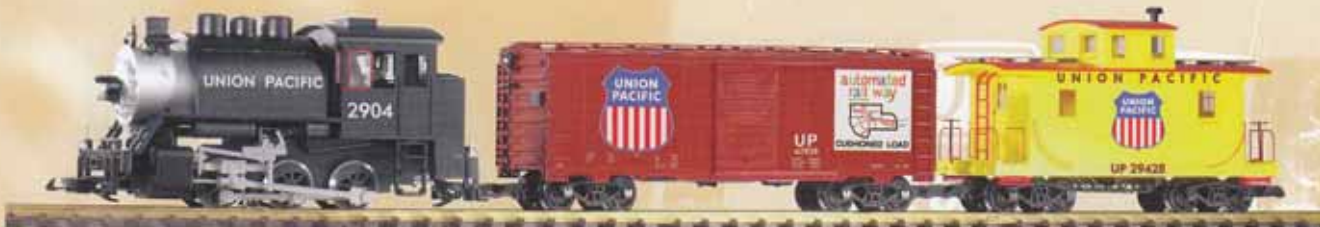
37101 Union Pacific Güterzug / Union Pacific Freight Train

Products bearing Union Pacific and Southern Pacific marks are produced under a trademark license from Union Pacific Railroad Company.