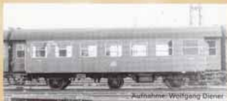
37600 Umbauwg. B3yg 2. Kl. DB Ep. IV Rebuilt Passenger Car B3yg 2. cl. DB IV